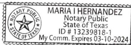
Notary Public Signature

Given under my hand and the seal of office the 16 th day of May , 2022